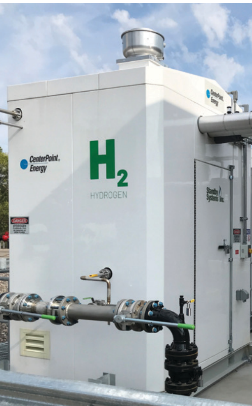
CenterPoint Energy green hydrogen pilot project in Minneapolis

Green hydrogen is expected to become economically attractive as the costs of both the production technology and the renewable electricity needed to make it continue to decline.