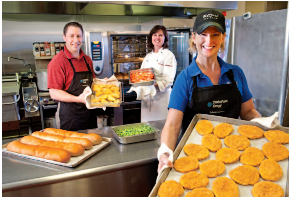
Use the combi oven for proofing dough; baking; roasting; braising; steaming; poaching; defrosting; re-thermalizing pre-plated meals; grilling and broiling.

The natural gas combi oven provides superior results with excellent efficiency: