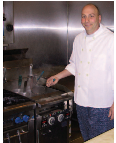
Natural gas pasta cookers are a great way to prepare pasta and other items that can be cooked in water.

Various basket options are also available, including individual and bulk-sized baskets. Other options include automatic basket lifts, integrated timers and faucets.