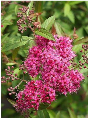
Bumald Spirea 'Anthony Waterer'