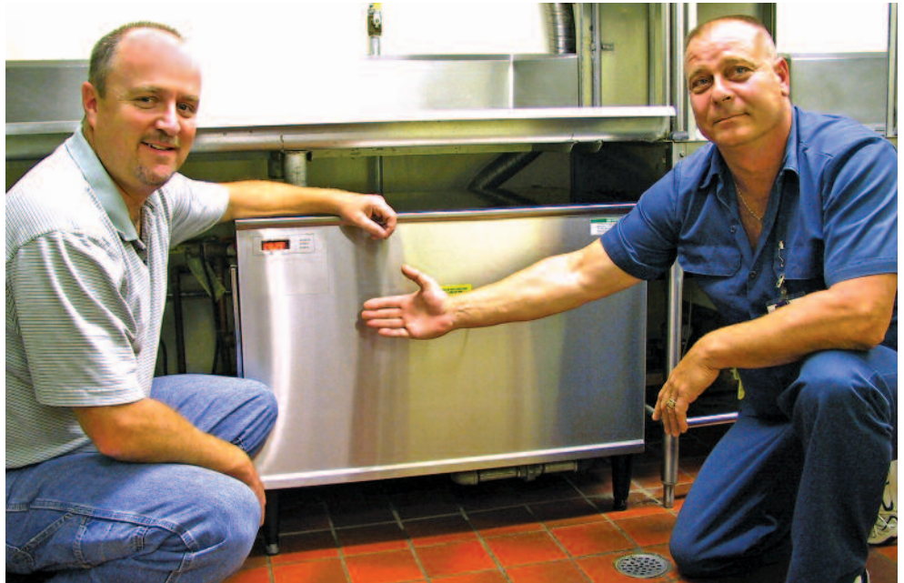
Natural gas booster water heaters boost rinse temperatures on demand.

The natural gas booster water heater is an efficient, cost-effective alternative to electric-powered booster heaters or chemicals. Because of its efficiency and precision, and the relatively low cost of natural gas, it can: