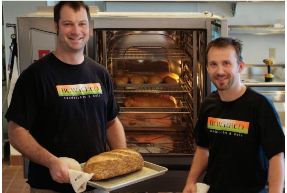
Use the combi oven for proofing dough; baking; roasting; braising; steaming; poaching; defrosting; re-thermalizing pre-plated meals; grilling and broiling.

The natural gas combi oven provides superior results with excellent efficiency: