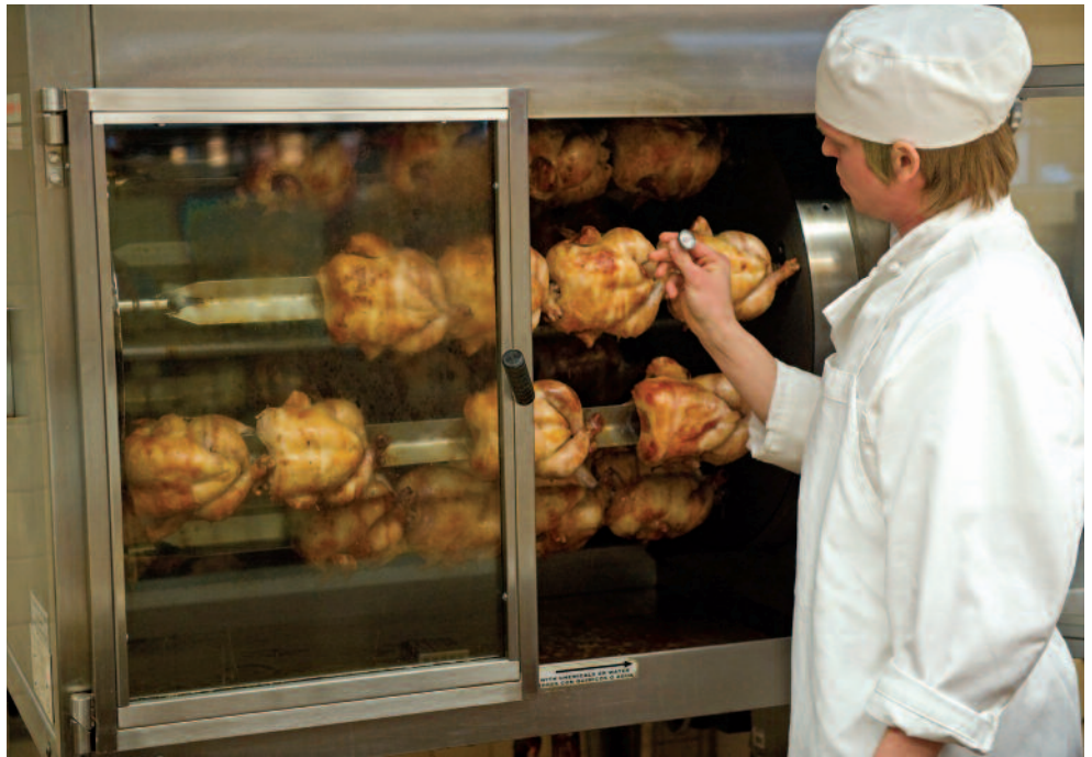
Natural gas rotisserie ovens offer efficient cooking with visual appeal.

A natural gas rotisserie oven is a showy and hard-working piece of equipment to have on any cook line. It gives you superior results with excellent efficiency and offers: