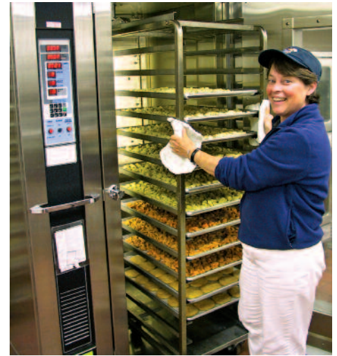
Natural gas rack ovens are a mainstay for schools, bakeries and hospitals.

Cooks preparing artisan breads, French baguettes, bagels and pizzas will appreciate the oven’s self-contained